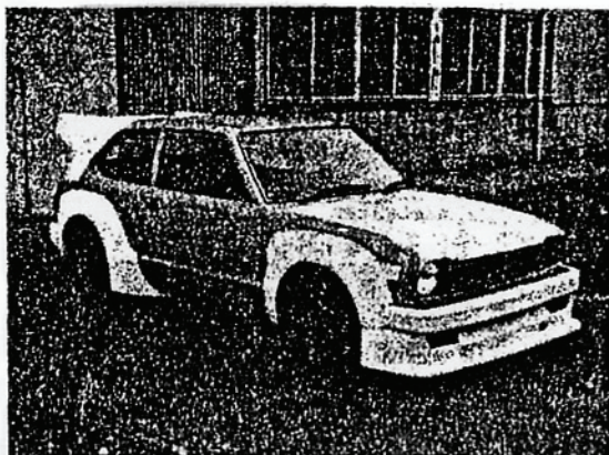
MUGEN CIVIC COMPLETE CAR